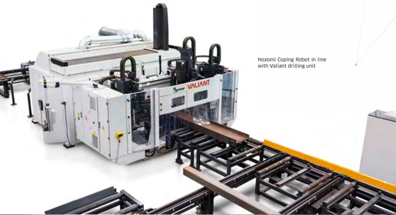
Nozomi Coping Robot in line with Valiant drilling unit