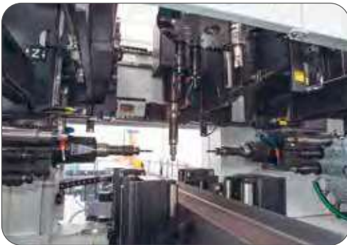
14-position tool changer

The Valiant product line is a new model three-spindle drilling system for the processing of the complete range of rolled structural steel sections. These new models are the result of the constant commitment by our engineering team to addressing the requirements of the world's structural steel fabricators.