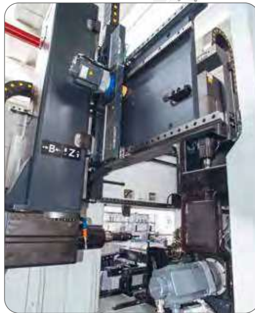
Auxiliary axes with 11-3/4" stroke