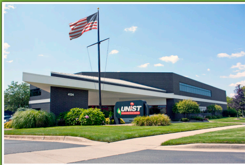
Unist headquarters in Grand Rapids, Michigan