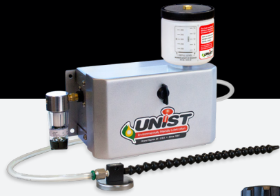
Coolubricator™ and Serv-O-Spray™ systems available with multiple outputs